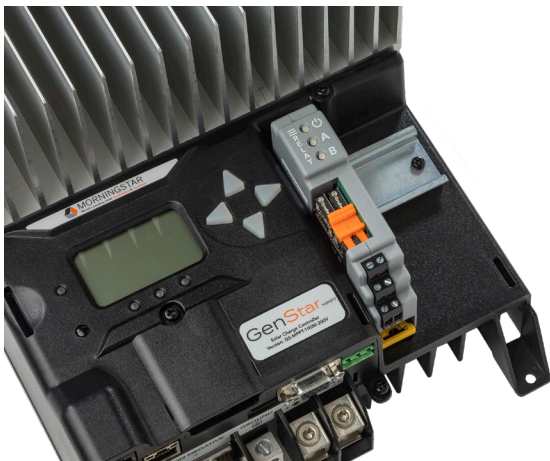
ReadyRelay installed in a GenStar MPPT charger