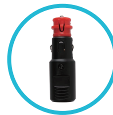
SAE TO CIG CABLE