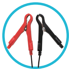
SAE TO ALLIGATOR CABLE