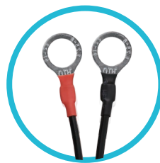
SAE TO RING CABLE