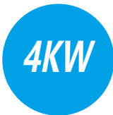
Pure Sine Wave Inverter